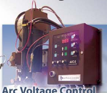
Arc Voltage Control