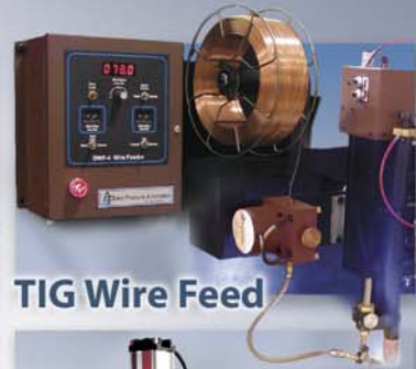
TIG Wire Feed