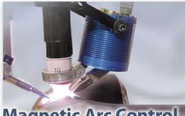
Magnetic Arc Control